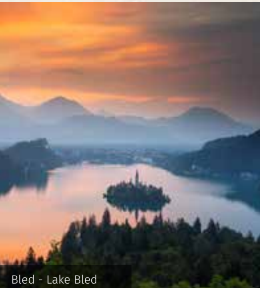
Bled - Lake Bled

Venice, Marco Polo 190 km (I) Klagenfurt 196 km (A)