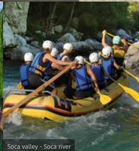
Soca valley - Soca river