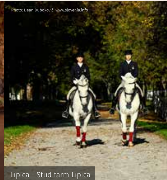
Lipica - Stud farm Lipica