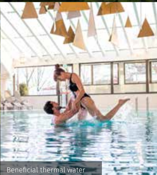
Beneficial thermal water