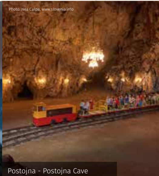
Postojna - Postojna Cave