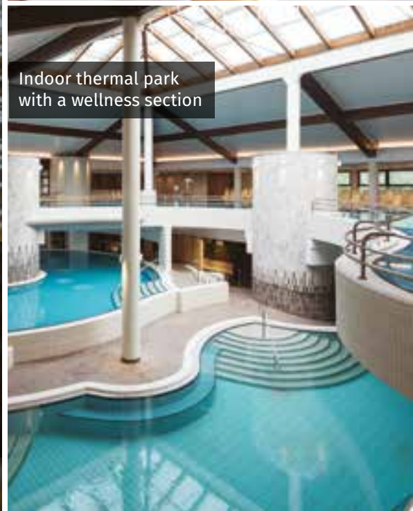
Indoor thermal park with a wellness section