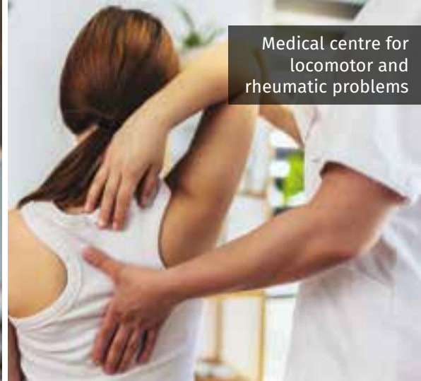
Medical centre for locomotor and rheumatic problems