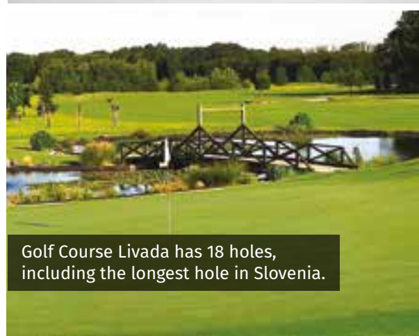
Golf Course Livada has 18 holes, including the longest hole in Slovenia.