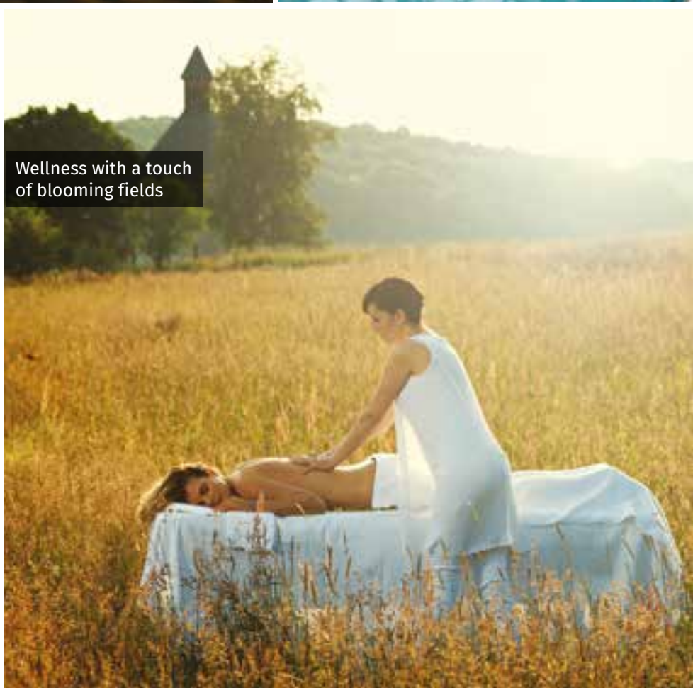
Wellness with a touch of blooming fields