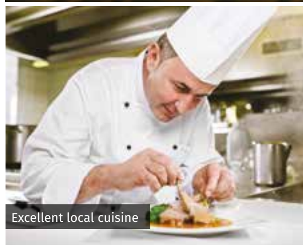
Excellent local cuisine