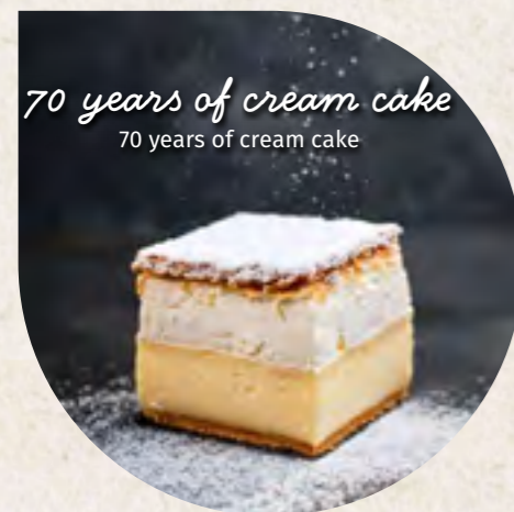
70 years of cream cake 70 years of cream cake